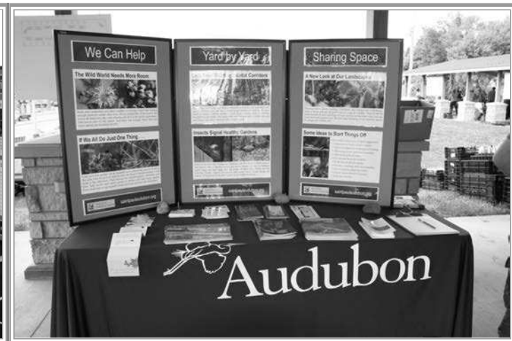
The Conservation Committee's display for the Landscape Revival and other tabling events.