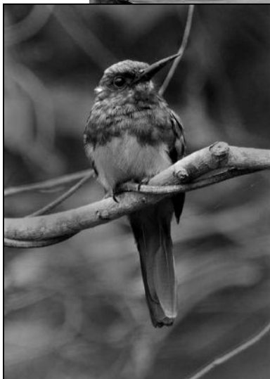
Blue-fronted Jacamar

Come and enjoy a perfect program for a cold December evening.