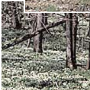
BOTTOM: LUSH FOREST TOP: INVADDED FOREST