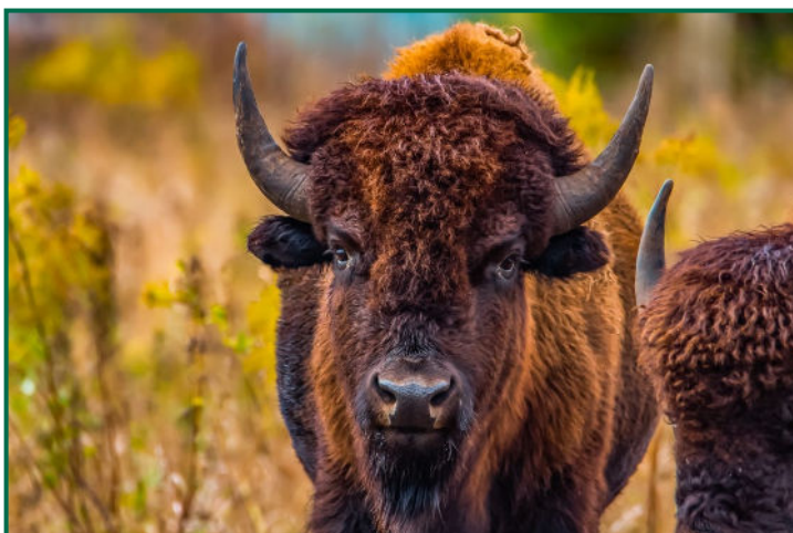
Belwin Bison