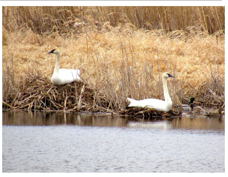
Trumpeter swans.

DIRECTIONS The time and travel distance are nearly the same whether you travel to Rochester, then use I-90, or if you travel along the river on US 61 in MN or partly in WI to I-90.