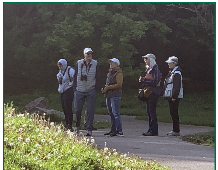
Swede Hollow on May 21; photo by Kiki Sonnen