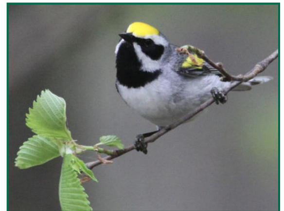
Photos by Monica Bryand: Scarlet Tanager, Prothonotary Warbler, Golden-winged Warbler