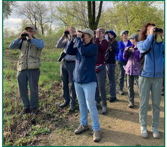
Above: Old Cedar Bridge on May 5; Below: Snail Lake on May 9