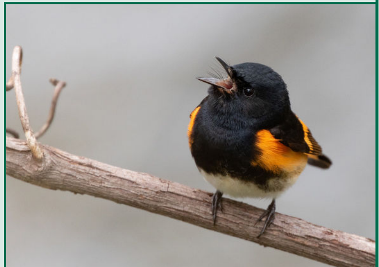
American Redstart