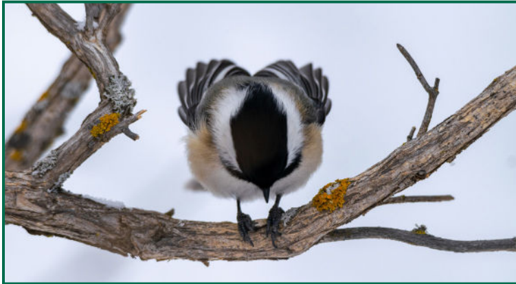
Black-capped Chickadee.