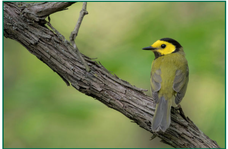
Hooded Warbler.

DIFFICULTY Approximately 3+ miles on wide, natural grass and dirt trails (some areas slightly rocky) with some moderate, long hills. This is our longest and most challenging trip. Pit toilets available at main trailhead near parking lot.