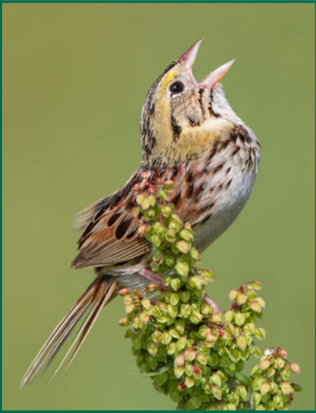
Henslow's Sparrow