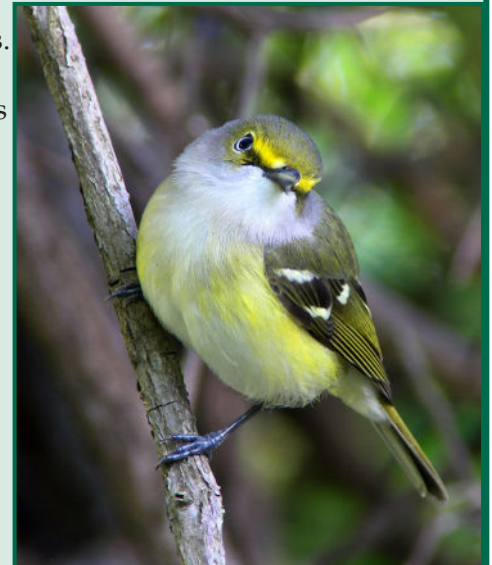
White-eyed Vireo

LEADER Greg Burnes gburnes@comcast.net 612-205-3071