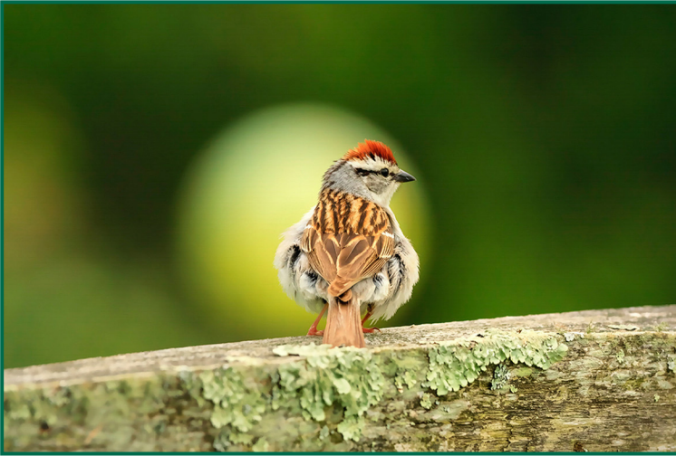
Chipping Sparrow

to Blue Jays - Bird at Battle Creek . This trip is offered in collaboration with Friends of Maplewood Nature