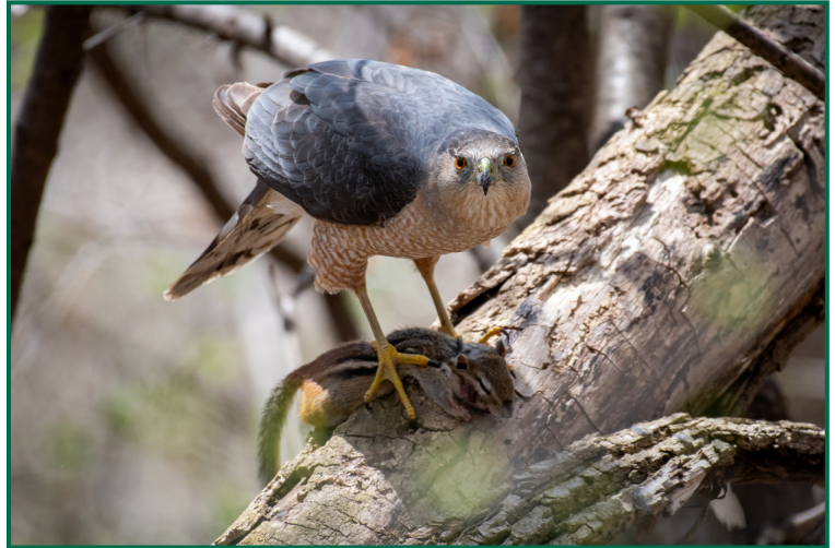
Coopers Hawk