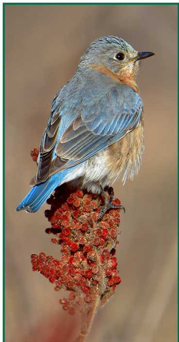
Eastern Bluebird

LEADER Greg Burnes gburnes@comcast.net 612-205-3071