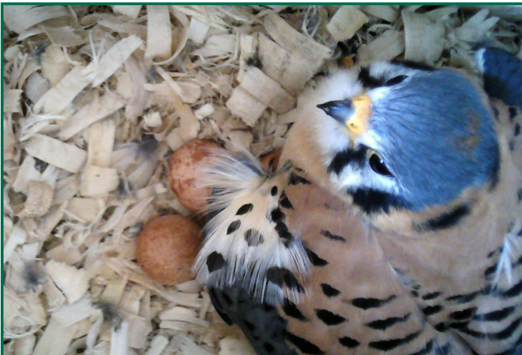
An American Kestrel on eggs in a nest box at Afton State Park.

Thank you to all the volunteers who make this program possible and for Saint Paul Audubon to achieve its mission. See "Get Involved," above, for information on how you can help too.