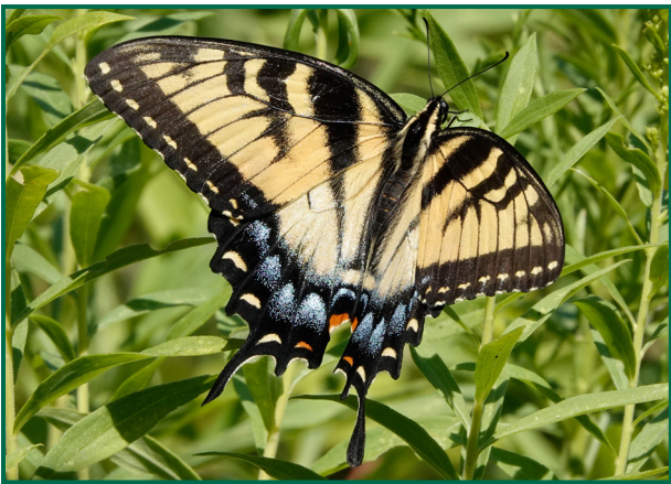
Left: Eastern Tiger Swallowtail

This annual event is part of the July 4th Butterfly Count coordinated by the North American Butterfly Association (NABA) . Saint Paul Audubon pays the NABA count fees, so the count at AHATS is free to all participants.