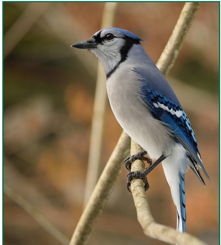
Blue Jay

Be sure to check https://saintpaulaudubon.org/up-coming-events/ for more details and field trip changes throughout the season.