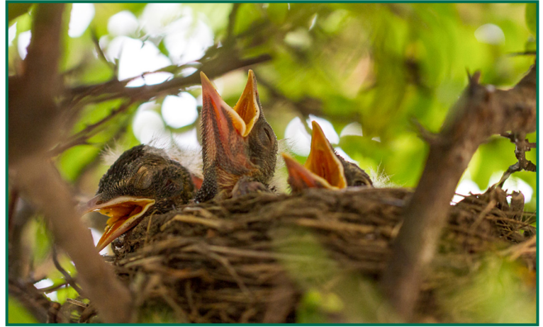
American Robin

DIRECTIONS Enter the AHATS campus on the Hamline Ave extension just north of MN Hwy 96. Turn left (west) on to Ben Franklin St; immediately take first right into parking area; immediately take another right hand turn onto short driveway leading to front (east side) of building. Park near the entry doors of 4761 Hamline