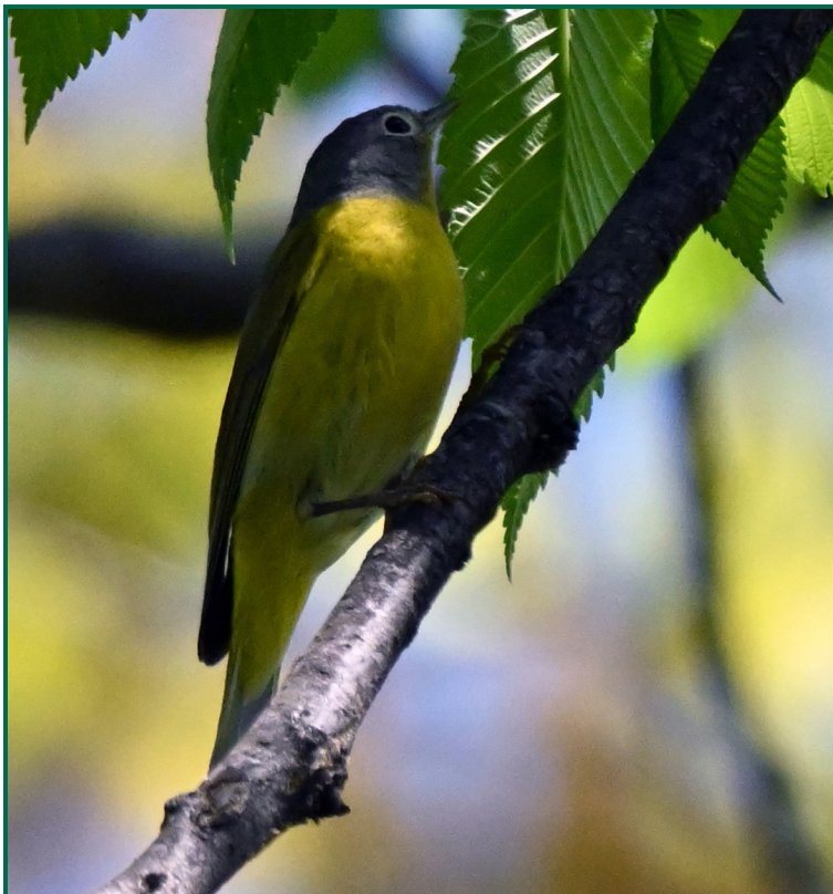
Warbler Weekend Above: Nashville Warbler; Right: Gray Catbird