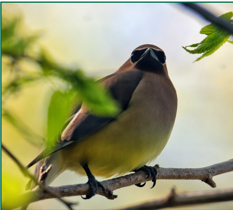
Warbler Weekend : Cedar Waxwing at Hok-si-la Park

Come and learn about birding, including how to use binoculars and a field guide. St. Paul Bird Alliance is collaborating with the St. Paul Library and the Urban Birding Collective to offer this beginning birding field trip.