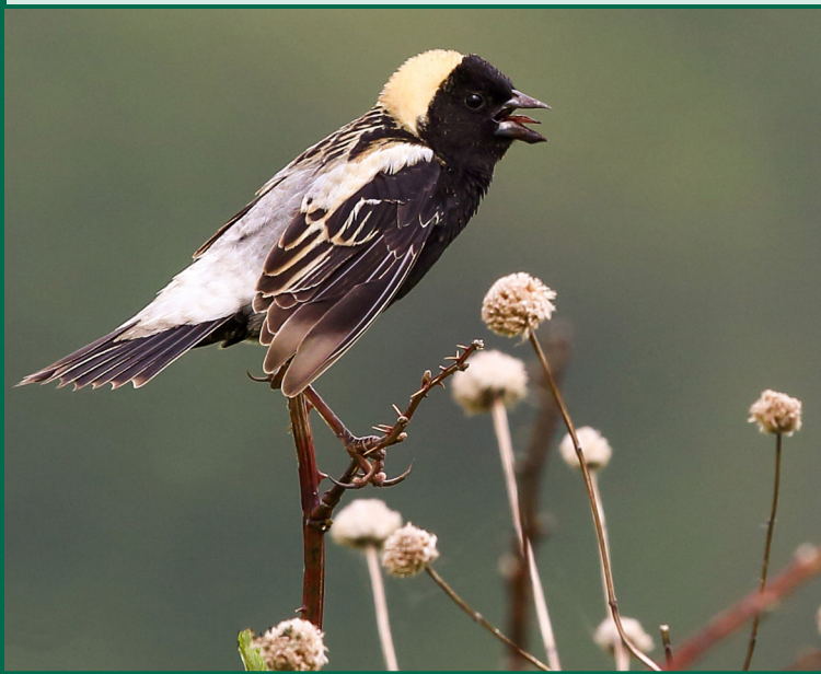
Bobolink