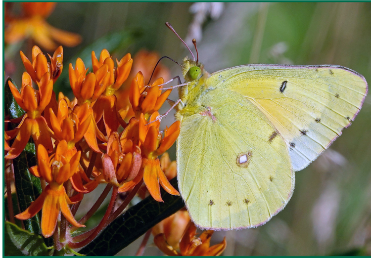
Orange Sulphur nectaring on butterfly weed

www.inaturalist.org A community science hub for submitting and exploring observations of organisms throughout the world. Over 35,000 observations of butterflies in Minnesota have been submitted to iNaturalist!