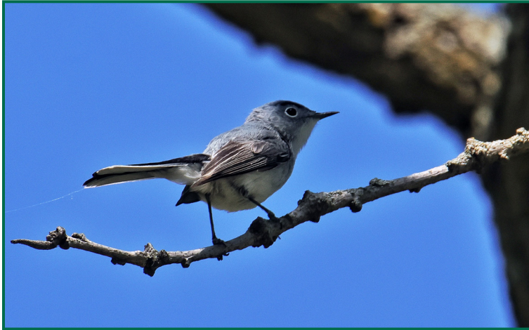
Warbler Weekend Blue-gray Gnatcatcher at Sand Point, Frontenac State Park

INFORMATION Dress for the weather and wear closed-toe shoes. Bring a brimmed hat and water; sun-block and bug dope advised. Loaner binoculars will be available.