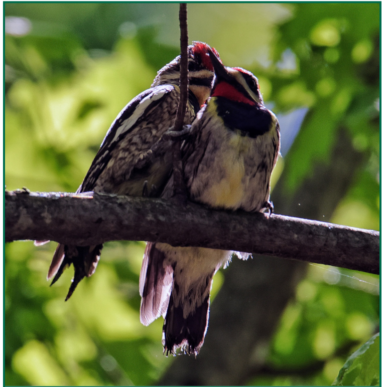
Warbler Weekend Yellow-bellied Sapsuckers at Sand Point, Frontenac State Park

DIRECTIONS Exit MN-36 onto US-61 South. Go 1.2 miles to Frost Ave. Turn left onto Frost. Go 0.6 miles to